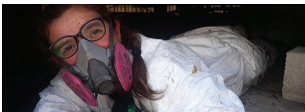
The Curtis Fund