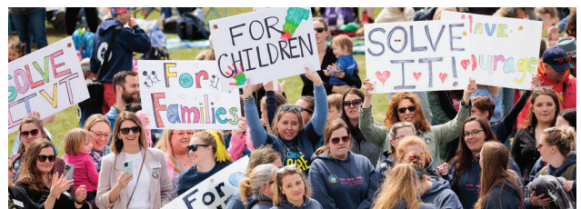
Let's Grow Kids