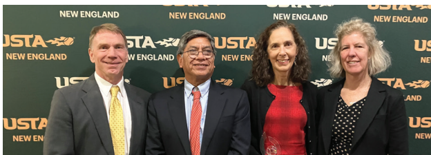
Addison Community Athletics Foundation

Each Community Foundation-stewarded supporting organization retains its distinct identity, including separate legal status, governing boards, and investment management. Benefits include favorable tax treatment and exclusion from various restrictions placed on private foundations, access to Community Foundation staff services, and a greater governance role.